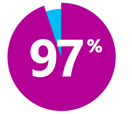
Have employees that use tablets for work.